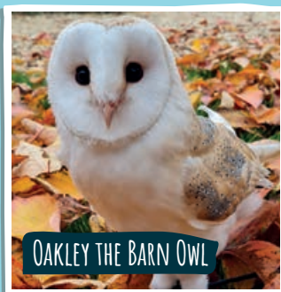
OAKLEY THE BARN OWL

Many of our birds have come from zoos and private collections. Others were injured or rescued native birds from the wild. We have a 'rescue and release' policy – so that wherever possible, we care for the birds until they are well enough to be released back into the countryside.