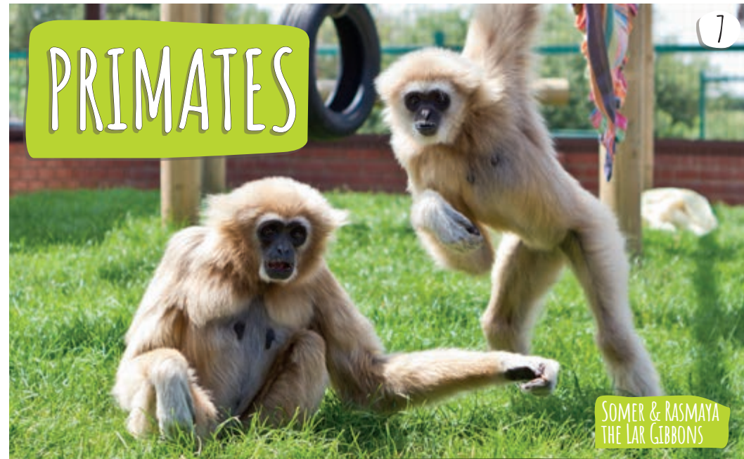
SOMER & RASMAYA THE LAR GIBBONS

OUR CHEEKY MONKEYS AND NOISY GIBBONS ARE ALL HOUSED IN LARGE, SPACIOUS ENCLOSURES. WE GIVE EACH ANIMAL EVERYTHING THEY NEED TO ENSURE THAT THAT THEY STAY HAPPY AND HEALTHY – THAT MIGHT BE A WATERFALL, CLIMBING FRAME, OR LOTS OF FOLIAGE TO PLAY AROUND IN.