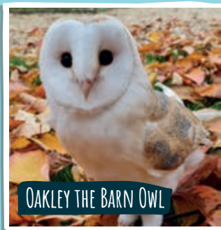
OAKLEY THE BARN OWL

Many of our birds have come from zoos and private collections. Others were injured or rescued native birds from the wild. We have a 'rescue and release' policy – so that wherever possible, we care for the birds until they are well enough to be released back into the countryside.