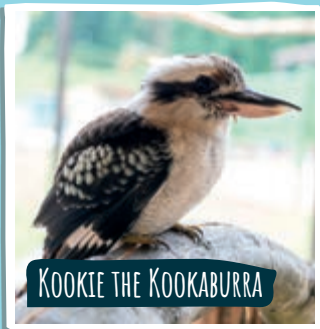
KOKIE THE KOOKABURRA

We're crazy about other types of birds, too. Kookie the Kookaburra is one of the noisiest and cheekiest creatures you'll ever meet – he likes a joke and finds visitors very amusing, so don't be offended if he laughs at you!