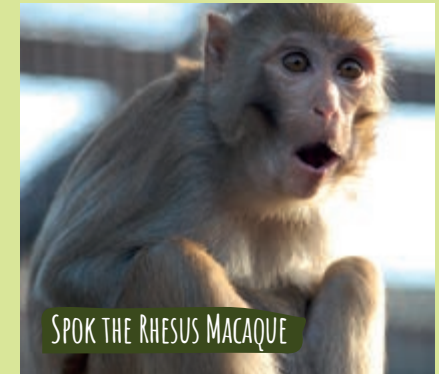
SPOK THE RHESUS MACAQUE

OUR TROOP OF BARBARY MACAQUES were rescued from the illegal pet trade – this sociable bunch love grooming and playing, and will devise imaginative games from simple props like a plastic cup or towel.