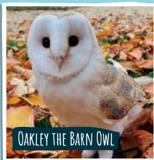
OAKLEY THE BARN OWL

Many of our birds have come from zoos and private collections. Others were injured or rescued native birds from the wild. We have a 'rescue and release' policy – so that wherever possible, we care for the birds until they are well enough to be released back into the countryside.