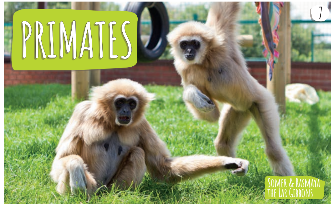
SOMER & RASMAYA THE LAR GIBBONS

OUR CHEEKY MONKEYS AND NOISY GIBBONS ARE ALL HOUSED IN LARGE, SPACIOUS ENCLOSURES. WE GIVE EACH ANIMAL EVERYTHING THEY NEED TO ENSURE THAT THAT THEY STAY HAPPY AND HEALTHY – THAT MIGHT BE A WATERFALL, CLIMBING FRAME, OR LOTS OF FOLIAGE TO PLAY AROUND IN.