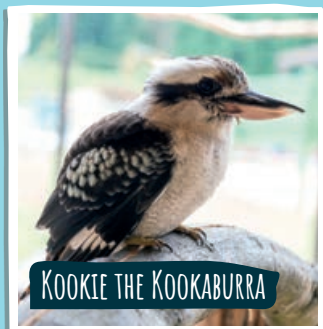
KOOKIE THE KOOKABURRA

We're crazy about other types of birds, too. Kookie the Kookaburra is one of the noisiest and cheekiest creatures you'll ever meet – he likes a joke and finds visitors very amusing, so don't be offended if he laughs at you!