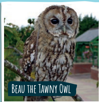
BEAU THE TAWNY OWL

Many of our birds have come from zoos and private collections. Others were injured or rescued native birds from the wild. We have a 'rescue and release' policy – so that wherever possible, we care for the birds until they are well enough to be released back into the countryside.