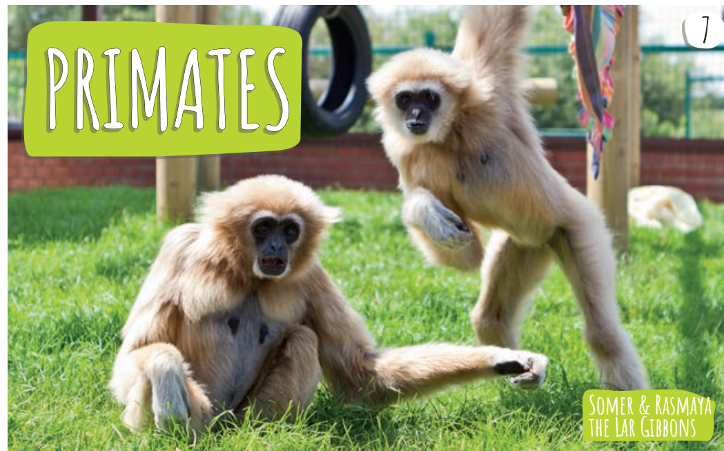
SOMER & RASMAYA THE LAR GIBBONS

OUR CHEEKY MONKEYS AND NOISY GIBBONS ARE ALL HOUSED IN LARGE, SPACIOUS ENCLOSURES. WE GIVE EACH ANIMAL EVERYTHING THEY NEED TO ENSURE THAT THAT THEY STAY HAPPY AND HEALTHY – THAT MIGHT BE A WATERFALL, CLIMBING FRAME, OR LOTS OF FOLIAGE TO PLAY AROUND IN.