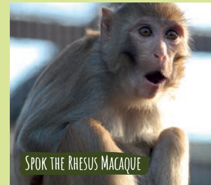
SPOK THE RHESUS MACAQUE

OUR TROOP OF BARBARY MACAQUES were rescued from the illegal pet trade – this sociable bunch love grooming and playing, and will devise imaginative games from simple props like a plastic cup or towel.